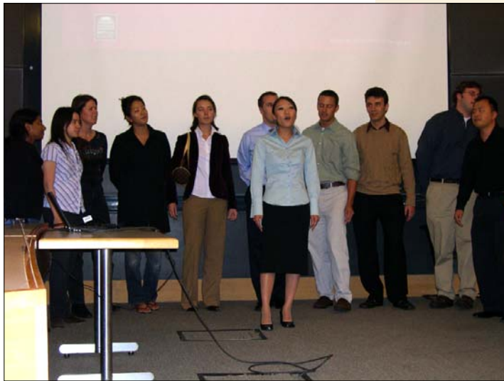
MIT Sloan's a cappella group, the E52s, perform George Michael's "Faith" at the end of the November Town Meeting.